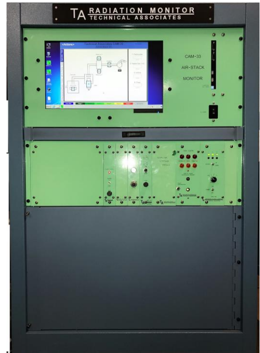
UNITECT-AIR ELECTRONICS CAM-33